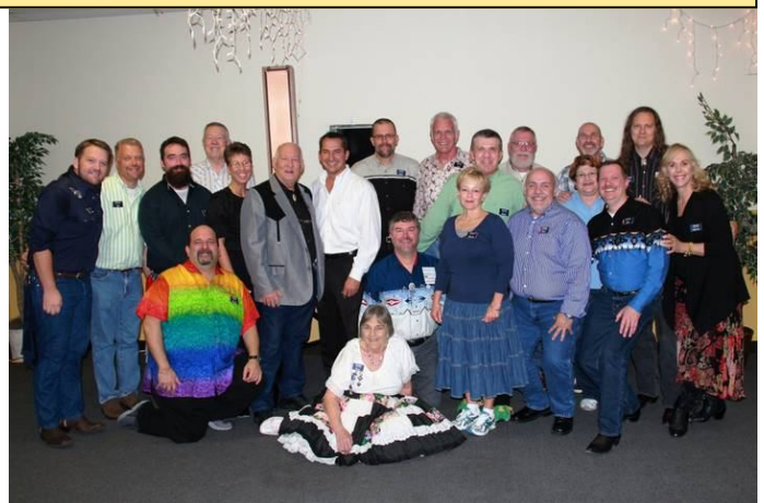
Twenty members of Hotlanta Squares stopped for a photo op after enjoying the October 14th dance with the JSquares.