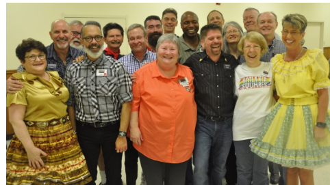
The Fifteen Hotlanta Squares Visitors

to take advantage of this opportunity to attend some of the Wheel Around dances. The next dance is